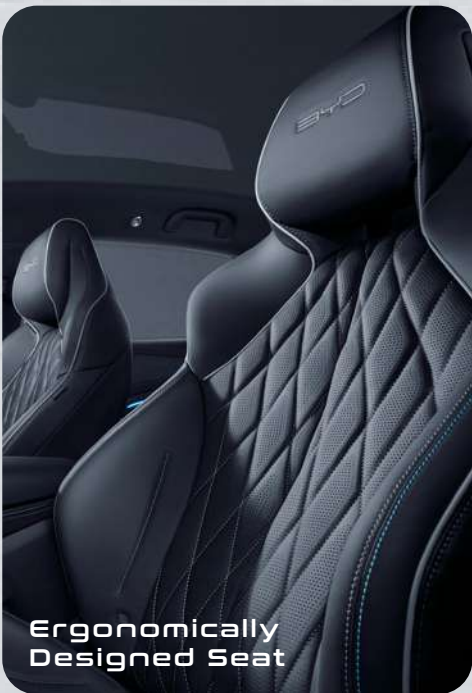
Ergonomically Designed Seat