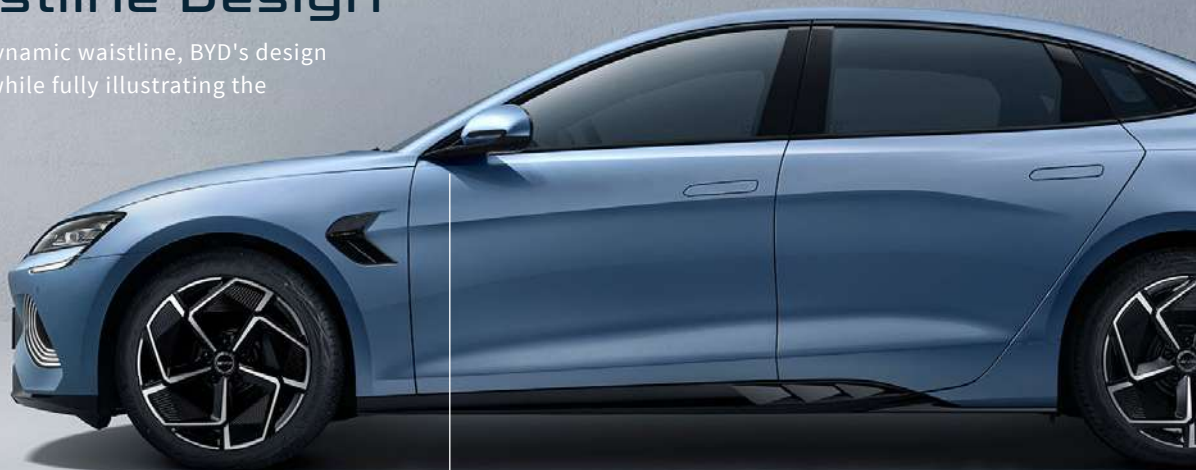
Waterdrop-Shaped Side Mirrors Inspired by the flowing design of the ocean

With its impressive and dynamic waistline, BYD's design reduces wind resistance while fully illustrating the fusion of sport and style.