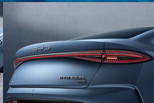
Boundless LED Tail Light