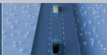
Adaptive Cruise Control Calibration