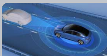
Predictive Collision Warning (Front)