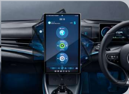
15.6-inch Rotating Screen (Supports Apple CarPlay® & Android Auto™)