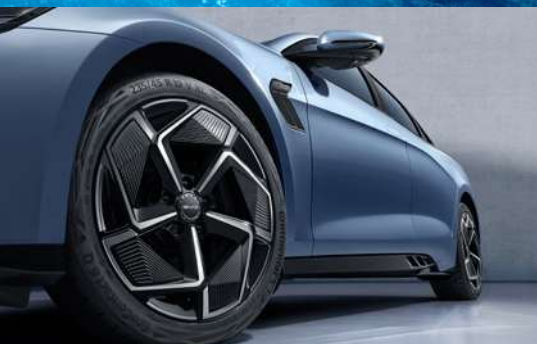
19-inch Large Wheel