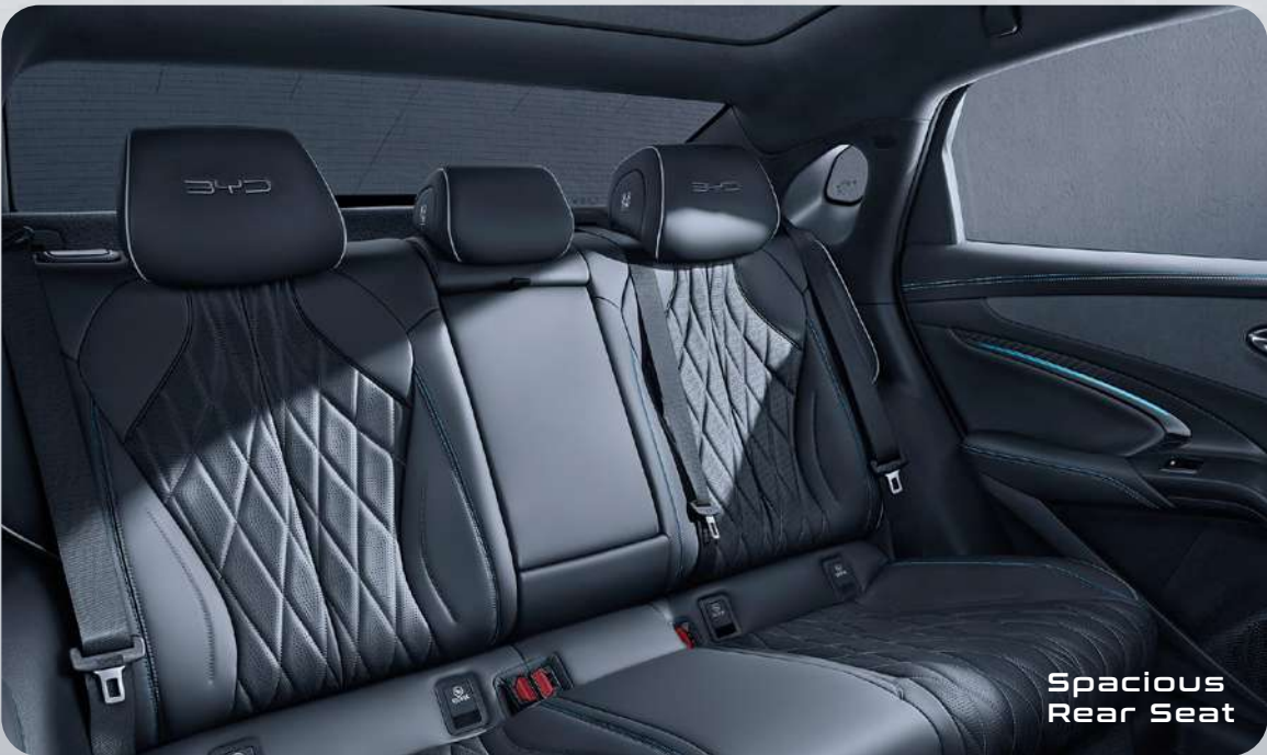
Spacious Rear Seat