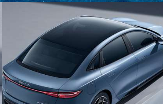
UV Resistance Double Glazing Panoramic Sunroof