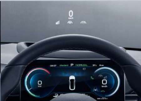
W-HUD Head-Up Display